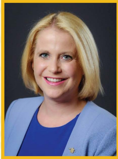
Hon. Lisa Beare, Minister of Post-Secondary Education and Future Skills