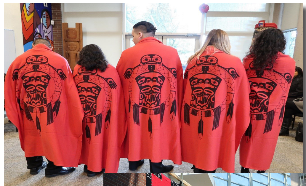
Blanket Ceremony for the Justice and Public Safety Careers Preparatory Program.

"So, we've connected with them already. And we've told them that, you know, we're your cheerleaders; we're here for you. You know, if you need anything, you guys come to see us and let us know. So that's how we reach out and support them and keep our connections with them and then try to get them connected with our with all the supports that we have in place because it's so different." (Participant 6)