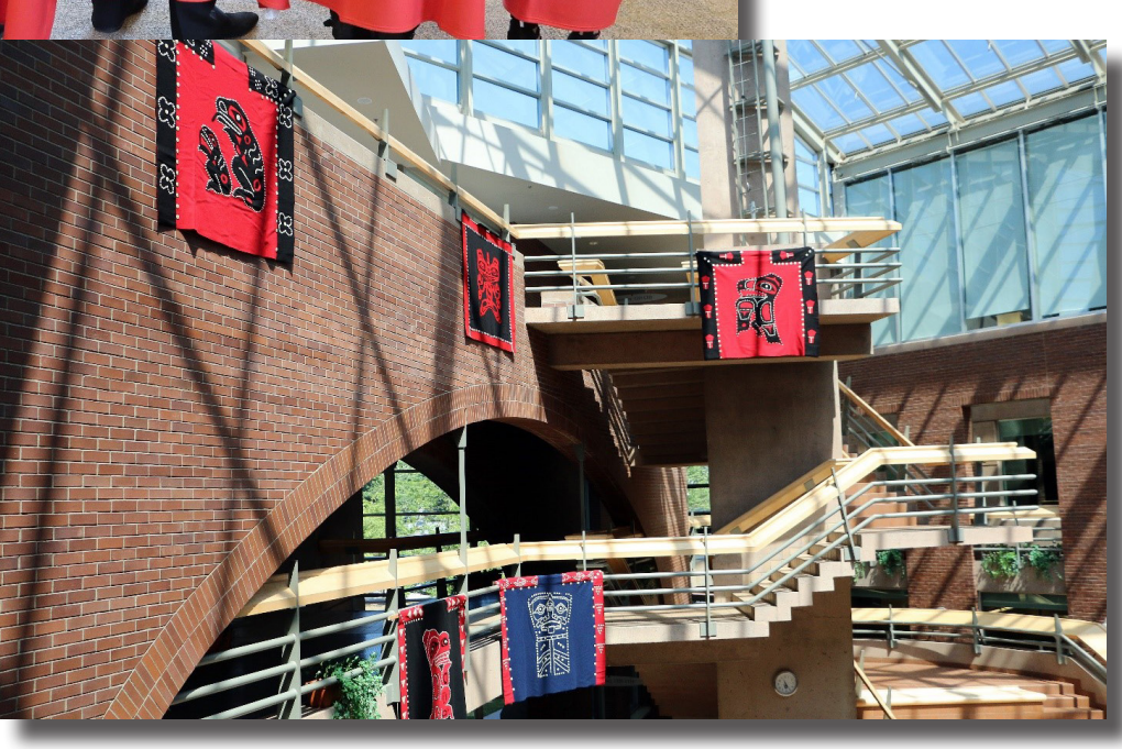
Button Blankets at JIBC's New Westminster Campus.