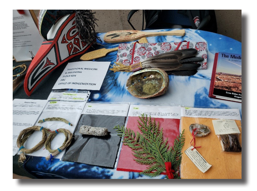
Mental Wellness from an Indigenous Perspective display for Bell Let's Talk at JIBC.

Multiple research participants discussed the positive policies and practices in place to support Indigenous students during transition into public post-secondary institutions. Pathway partnerships with IAHLA institutions are one of the practices that strongly support Indigenous students on their educational journey. Relationships that are developed between the IAHLA and public-post secondary institutions have the potential to set students up for success. But in some instances, these supports are not enough. IAHLA participants shared a number of ways that they struggle to maintain pathway partnerships. One challenge is difficulty in helping students navigate multiple steps in the application process. This can be as simple as students not having access to printers, difficulty in connecting with appropriate support staff, and issues with accessing official transcripts. Many IAHLA institutions compile courses from multiple institutions to create a